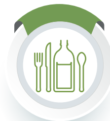
Food & Beverage Industrial UV