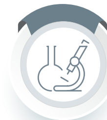
Pharmaceuticals Industrial UV